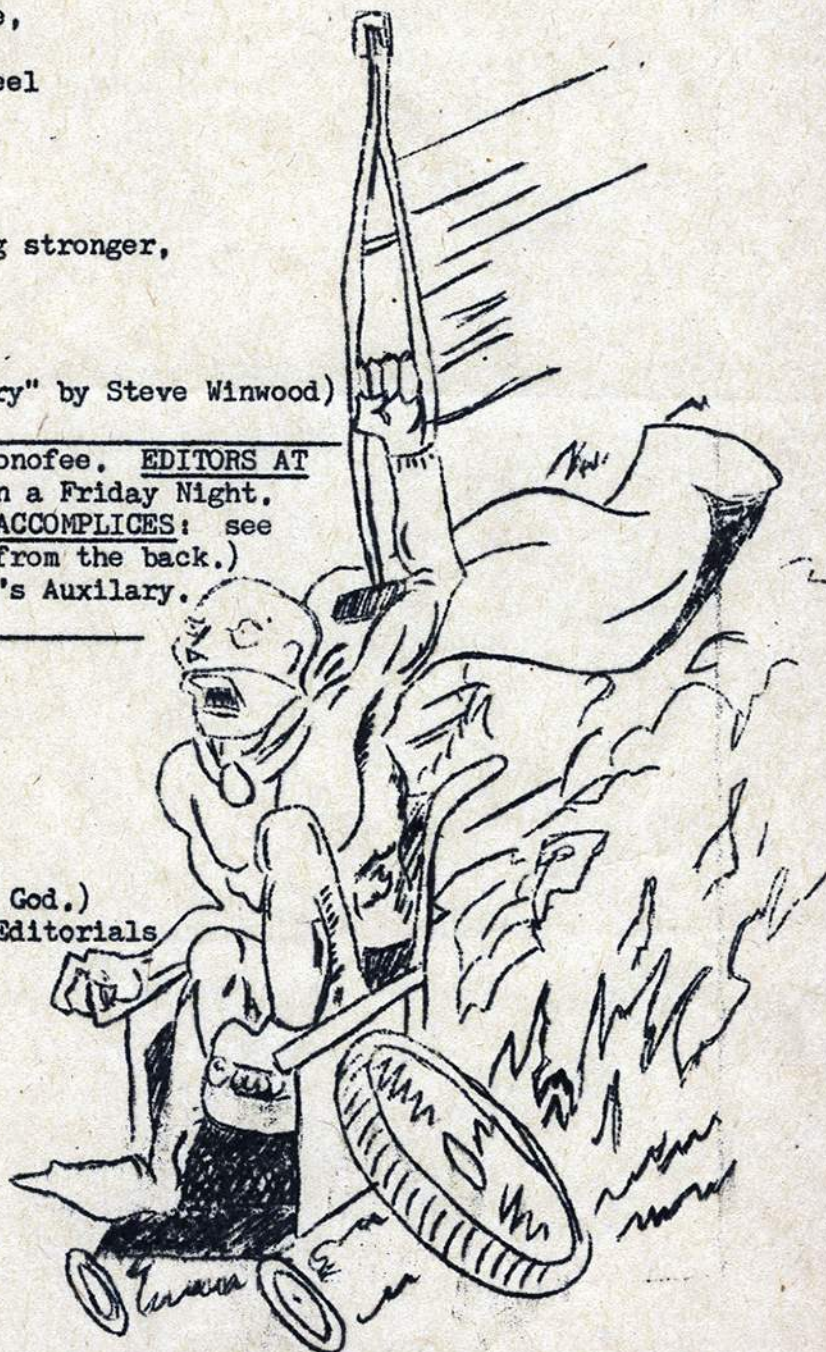
SUPERPOAPST on the warpath. See page 2.